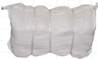
Bulk Bag 240 pairs