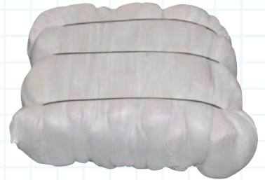
Bulk Bag 720 pairs

These reduced environmental impact polycotton knitted gloves are economical, highly absorbent and a good thermal insulator. Wear them alone, or under rubber or chain-mesh gloves for comfort or warmth. One size fits up to large.