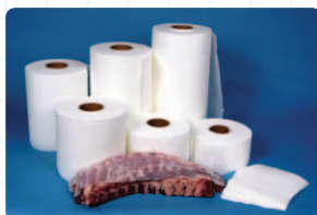
BoneCover™ On a roll (Catalogue page 108)