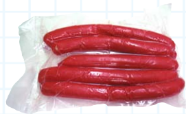
Vacuum Pouches (non-shrink) (Catalogue page 117)