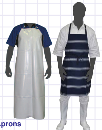
Aprons See pages 80-81