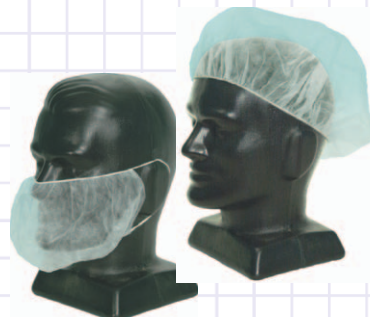
Beard Covers, Hair Nets See page 94